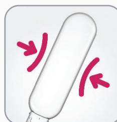
soft and elastic aspirating ball

Variants - Available in both 1 mL and 3 mL sizes, offering flexibility to suit various needs and applications