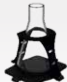
Rubber holder for flask