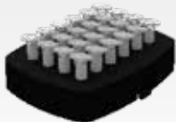
Foam for microtubes