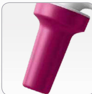
Autoclavable tip cone